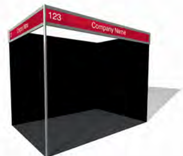
3 x 2m site with fascia

WIOA reserves the right to assign or reassign exhibition site/s and to alter the size, shape or position of the site/s and the floor plan of the exhibition as may be necessary to ensure that the arrangement of the exhibition is in the best interest of attendees and exhibitors.